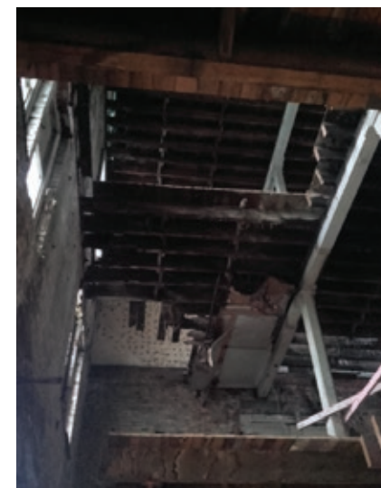
Inside the badly deteriorated building, before the upgrade works began.

The way the three owners have returned a degree of status and charm to the building is a credit to their drive, passion and vision.