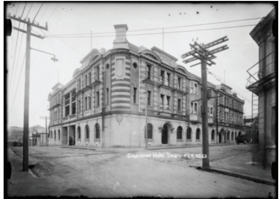
Grosvenor Hotel, Timaru.