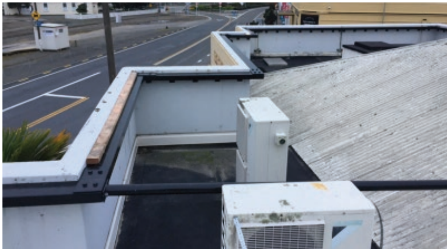
Tying the brick parapet to the roof.

The building had been underutilised for some time so seismic strengthening work was completed along with a major refurbishment and alterations to the internal layout to accommodate new tenants. A new brewery and an urban winery feature in the tenant mix. Both have been drawn to the sensitive upgrade of the building's significant architectural features.