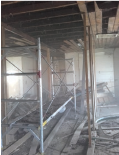
Inside the building, while the works were underway.