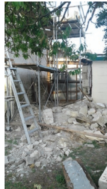
Hurunui Hotel exterior with strengthening works underway

In reviewing the Strong’s funding application, the Heritage EQUIP panel praised the upgrade solution for being ‘sympathetic to the heritage values of the hotel.’