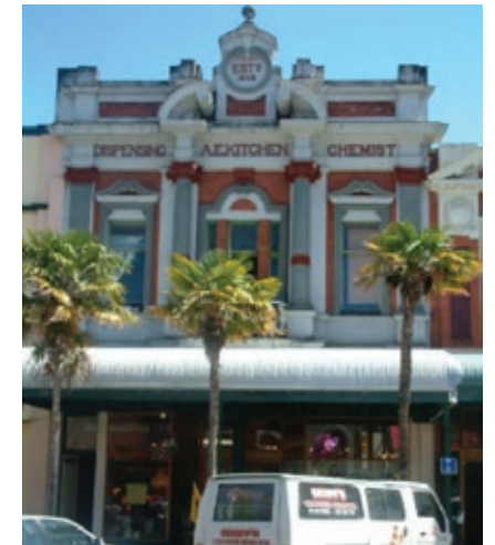
Register Item no: 395.

Kerry kept EQSTRUC on the project but asked them to go back to the drawing board.