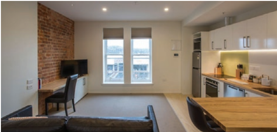
The former Union Steam Ship Company’s Store now provides modern apartments.

“It was boarded up and a metre deep in pigeon poo, and had flooded on three of the floors. It was a monumental effort to clean the place up and it’s quite an achievement to get this place to where it’s looking pretty good.”