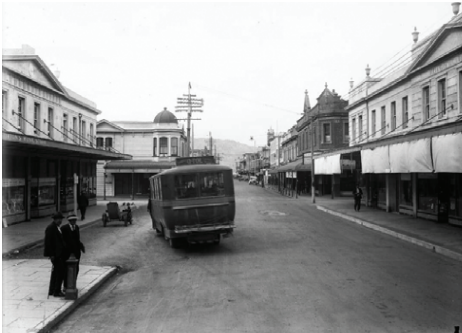
135–141 Jackson Street in 1929 (front left): looking down Jackson Street, Petone, with Stirton's Music Store and the Alexandra Building in the foreground.