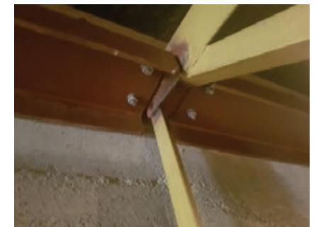
New steel cross bracing added to the roof space.