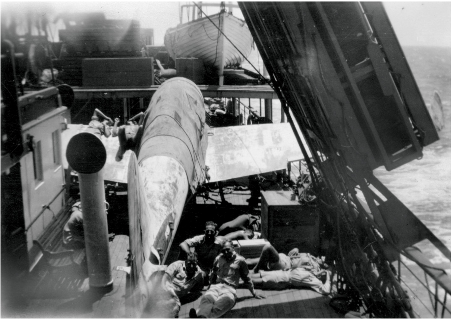
Troopship SS Wahine on the way to New Zealand from the Pacific Islands, carrying a Mitsubishi Zero (later NZ6000), circa October 1945.