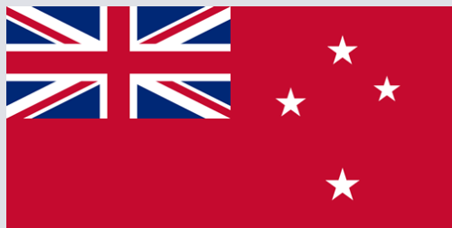
New Zealand Merchant Navy