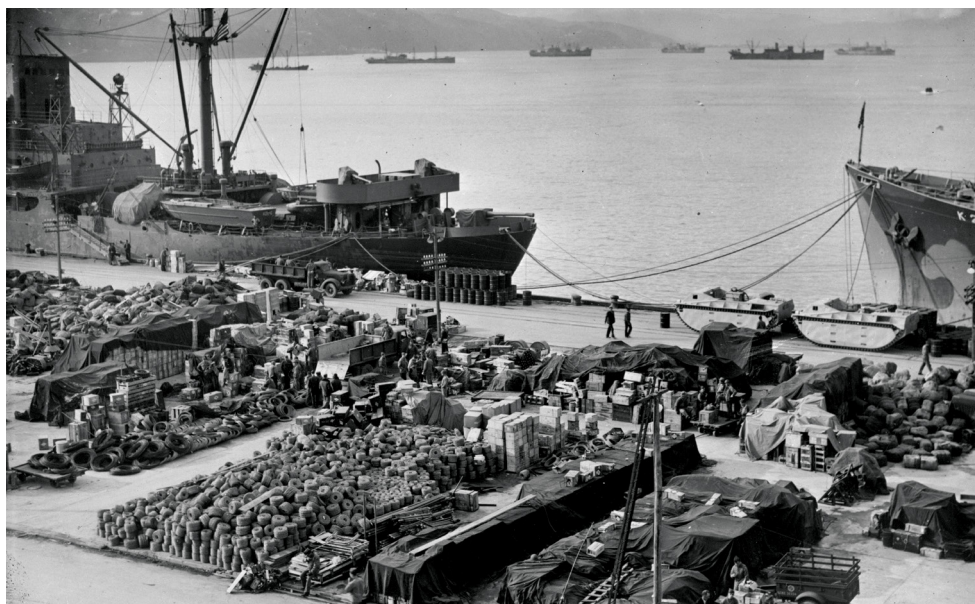
American World War II supplies for the Guadalcanal campaign ready for transport on Aotea Quay, Wellington, 1943. Image courtesy of Alexander Turnbull Library, Ref: PAColl-6075-32