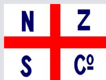
New Zealand Shipping Company