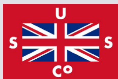
Union Steamship Company of New Zealand