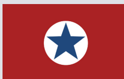
Blue Star Line