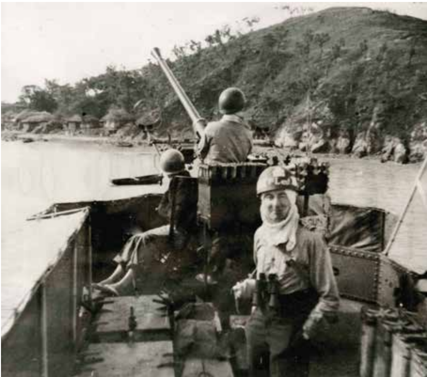
THE NATIONAL MUSEUM OF THE ROYAL NEW ZEALAND NAVY

Veterans and guests may place poppies on the Tomb of the Unknown Warrior